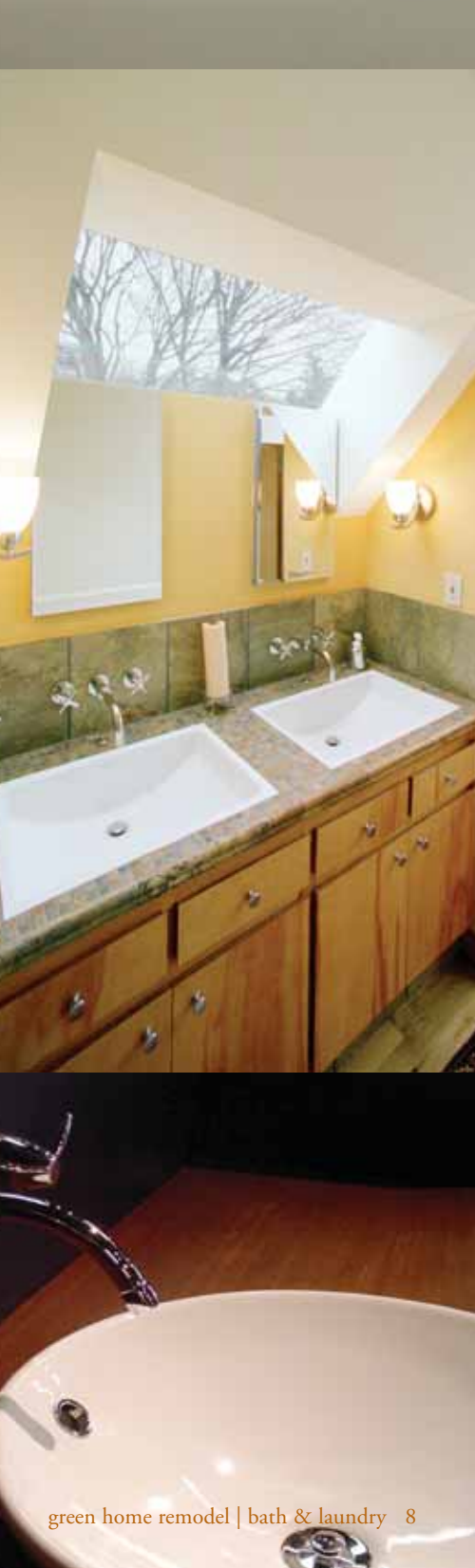
Photo middle right: VELOCIPEDE architects (photo © Michael Moore). Photo bottom right: Environmental Home Center.

If you're reusing your existing faucet, see if it can be outfitted with a water-conserving aerator -a device that screws onto the end of the faucet to reduce flow, either by adding air to the stream or directing the flow into multiple small jets. Aerators that deliver water at rates as little as one gallon per minute are sufficient for most lavatory tasks.